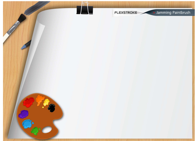
Figure 4: FLEXSTROKE User Interface

The tip color indicates painting color in physical world, so we add color-picking function to our tip. We use three led lights to get the 3-primary colors (RGB). They are placed in a plastic ball for scattering and connected to an Arduino board. The voltages are digitally controlled, mapping 0-3.3V